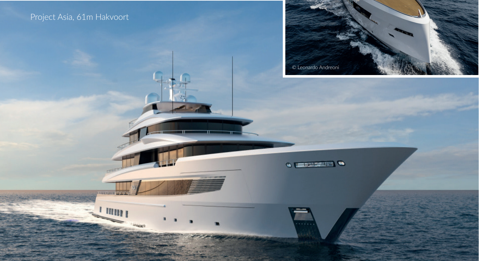
Project Asia, 61m Hakvoort