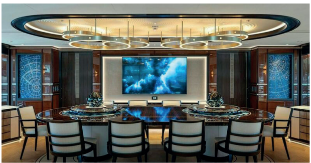
M/Y Lusine, 60m Heesen