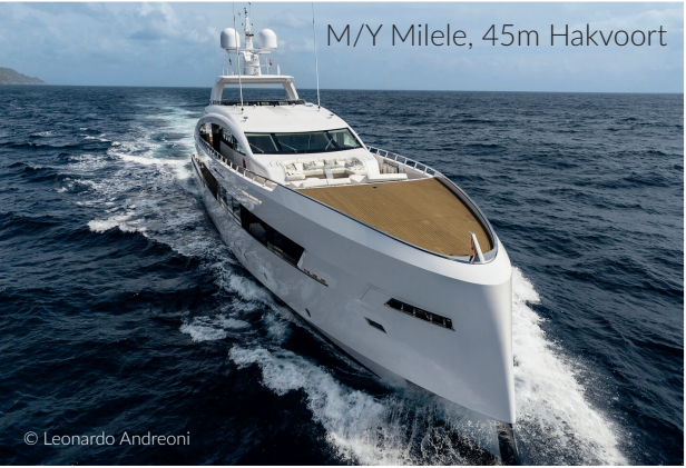
M/Y Milele, 45m Hakvoort