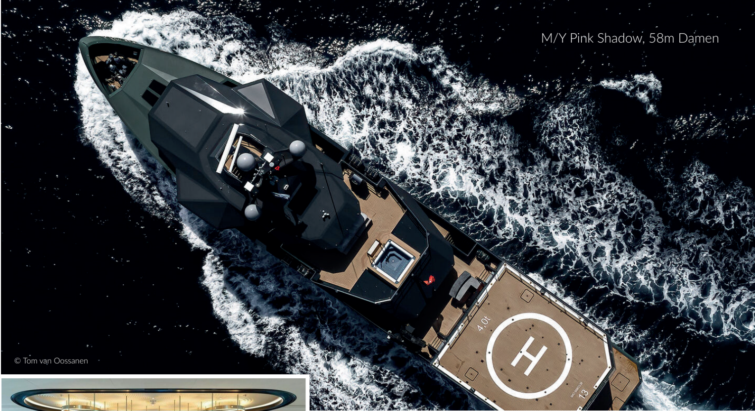
M/Y Pink Shadow, 58m Damen