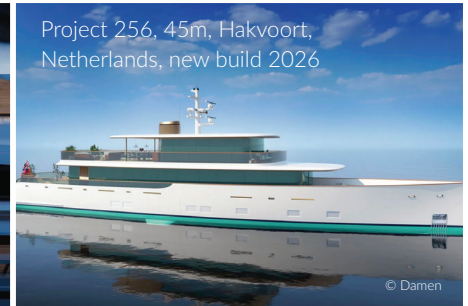
Project 256, 45m, Hakvoort, Netherlands, new build 2026