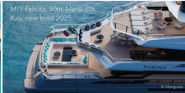
M/Y Felicita, 50m, Mangusta, Italy, new build 2025