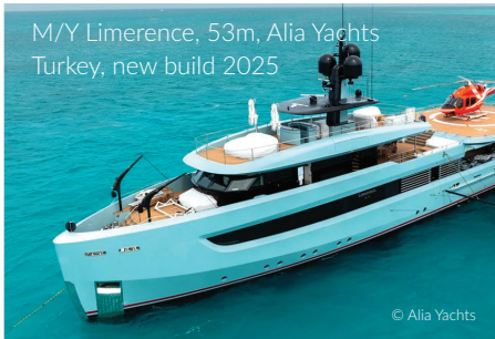
M/Y Limerence, 53m, Alia Yachts Turkey, new build 2025