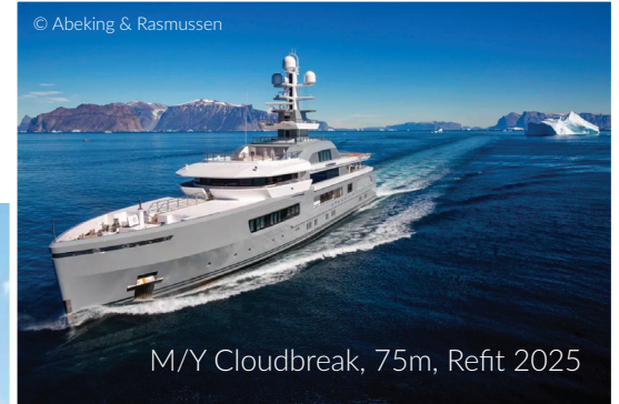
M/Y Cloudbreak, 75m, Refit 2025