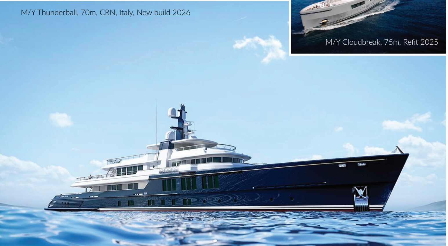
M/Y Thunderball, 70m, CRN, Italy, New build 2026

Over 35 large yacht projects delivered in the past 5 years including new builds and refits