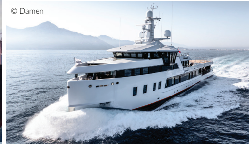
M/Y After you, 60m, new build 2025